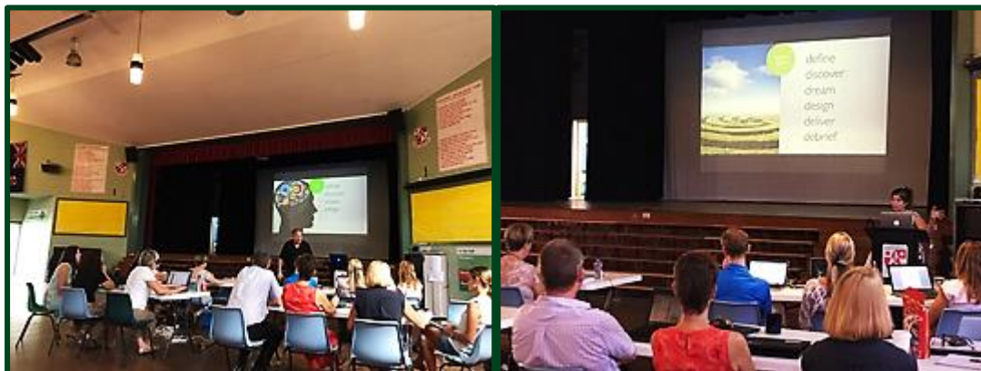
Exciting times ahead at Avalon – challenging minds and building character.